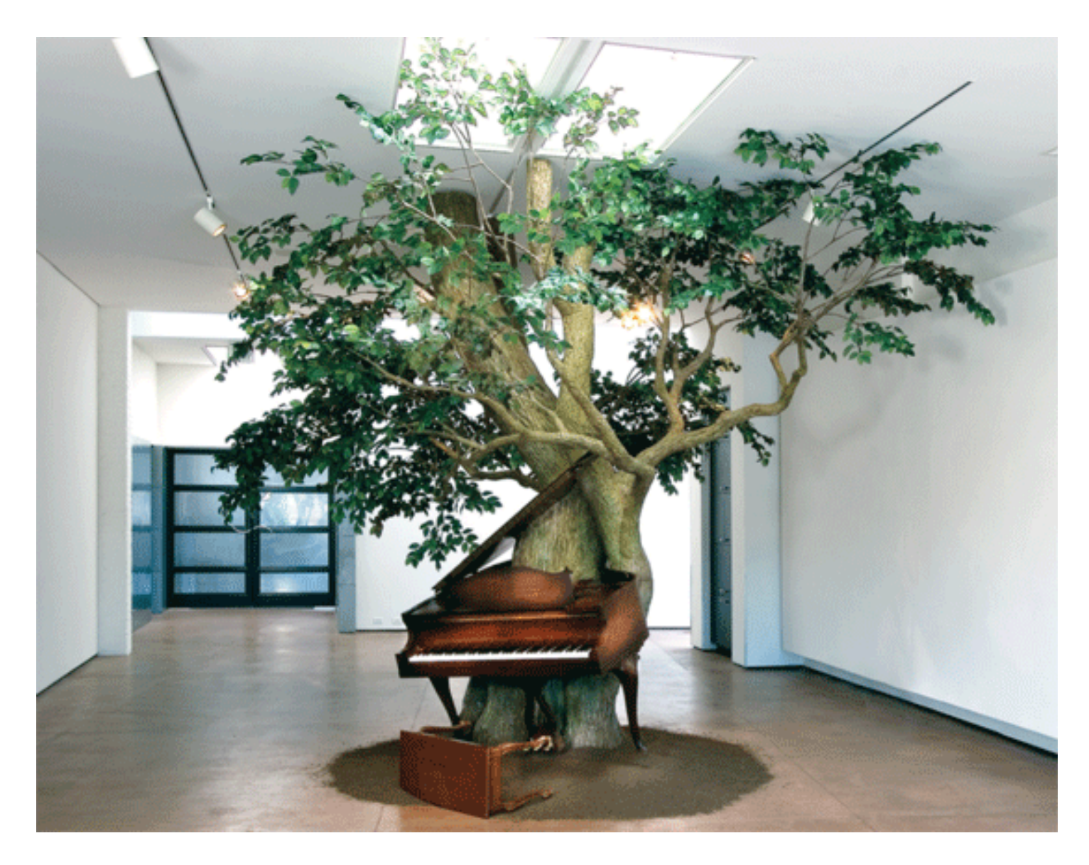
Sanford Biggers, Lotus, 2007. Steel armature and etched glass, 84 x 3/4 in. 1 AP.

Part of what stuns me about Sanford Biggers' Blossom, 2007, is that I'm still awed by seeing and hearing it. How did this piano grow out of a tree? What does that mean? Strange Fruit reminds me that black people/cultures are still oppressed and still sing. Just as the aesthetics and significances of Blossom—including its unexpected title – continue to resonate, the process views show a few of the hundreds of decisions that went into its making.