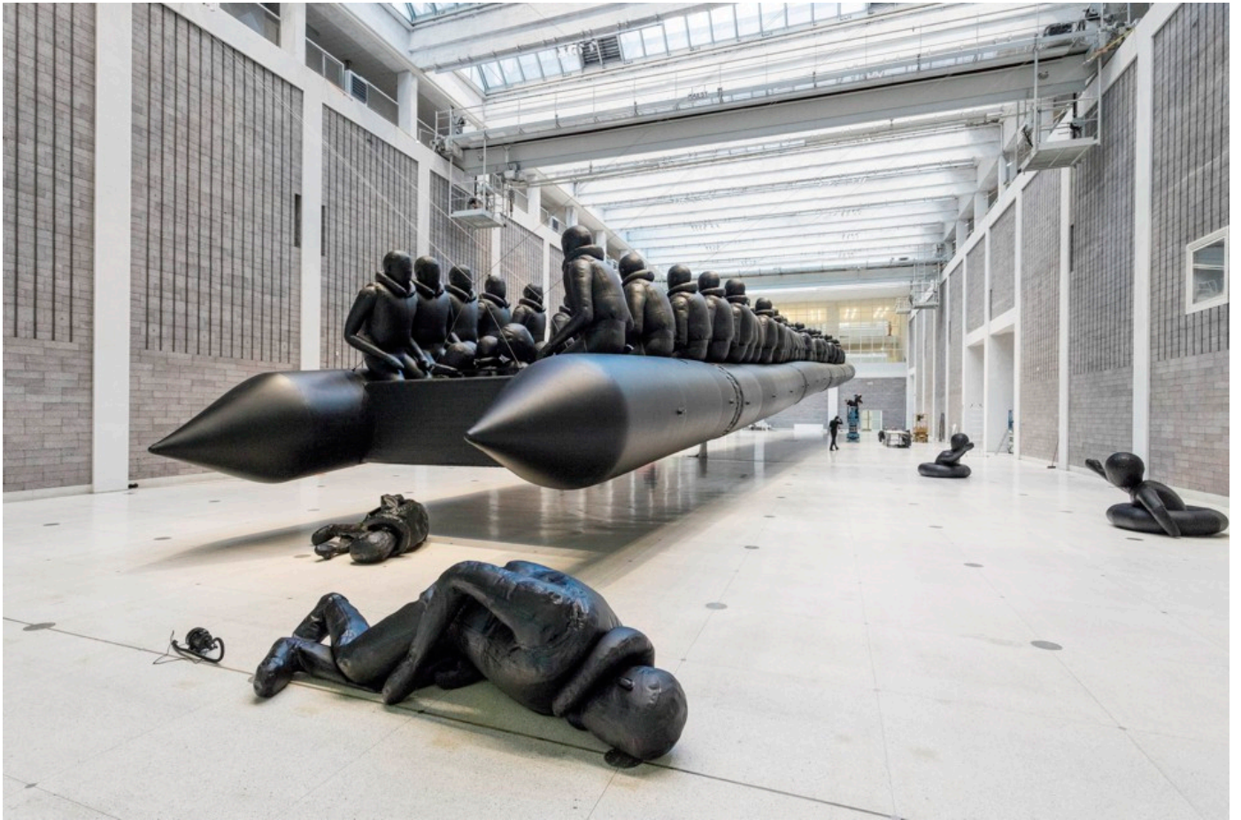
Ai Weiwei's installation, Law of the Journey , at the National Gallery in Prague