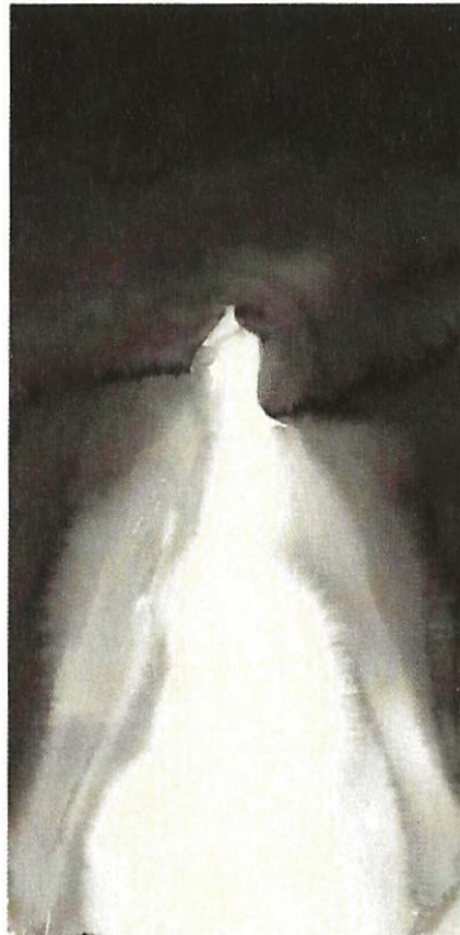
Queen of Naples Ghost, 2013 dye sublimation on silk